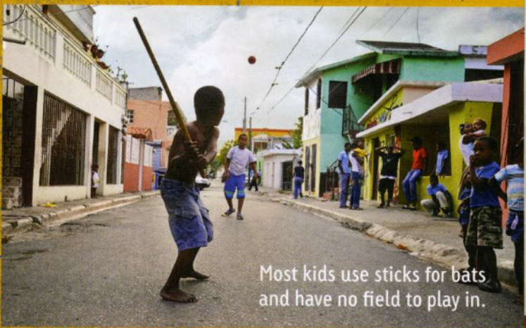
Most kids use sticks for bats and have no field to play in.