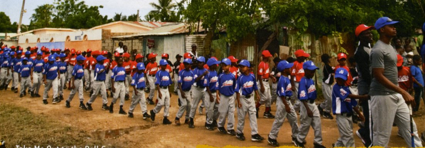
Take Me Out to the Ball Game ...

A church in Batey Aleman teamed up with the Pujols Family Foundation to bring the first big day of fun to these Compassion-sponsored kids.