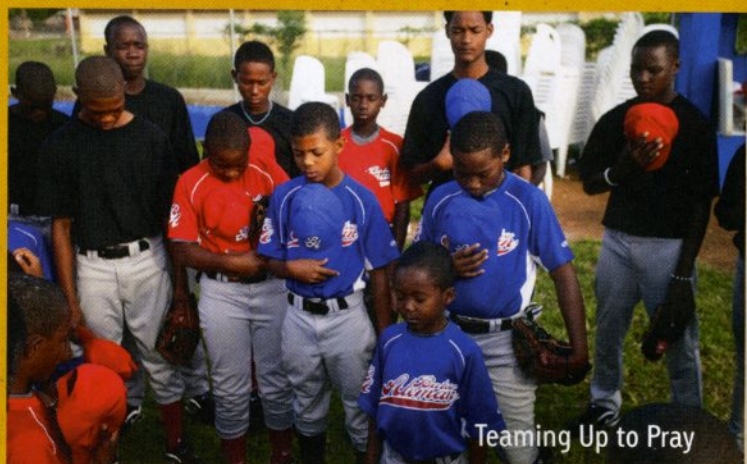
Teaming Up to Pray